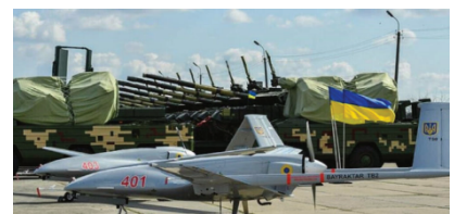
Turkish-Ukrainian Military Drone Bayraktar TB-2