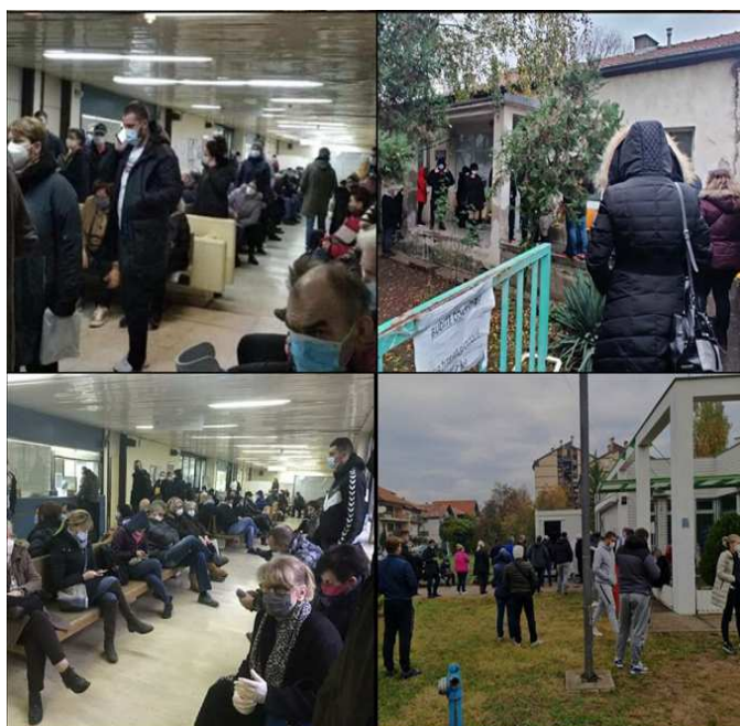
Queuing in hospitals in Serbia during Covid 19

Therefore, we consider it is sensible to repeat the demands that our organization, the Anarcho-Syndicalist Initiative, as well as the entire International Association of Workers, expressed at the beginning of the pandemic: