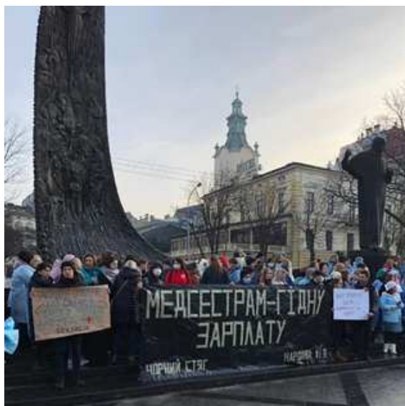
Lviv, December 21, 2020: Worthy salary for the nurses